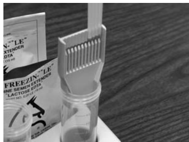
Figure 4. Align filled straws (P/N 537-670-CLE) with guides on the ARS Bubbler Comb.