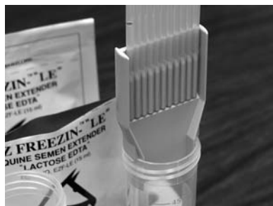
Figure 6. Repeat until the ARS Bubbler Comb has been filled.