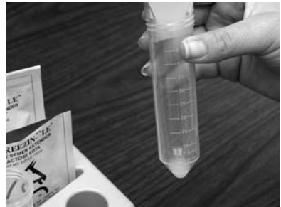
Figure 10. Drainage in tube with bubbler comb can be used to fill additional straws.