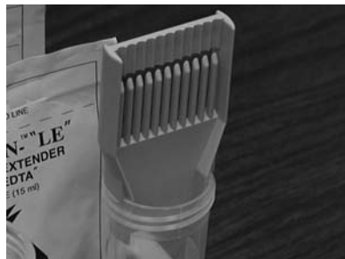
Figure 2. Bubbler Comb should fit snugly inside tube.