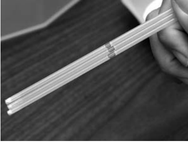
Figure 9. Gently shake straws until air bubble is in the center of the straw.