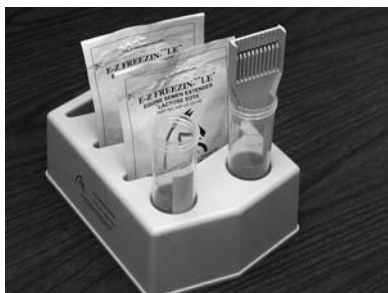
Figure 3. Place centrifuge tube in a rack. The E-Z Freezin® Packet Stand (P/N EZF-PS) is shown here.