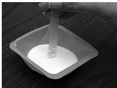
Figure 7. Seal straws with sealing powder (P/N 537-671).