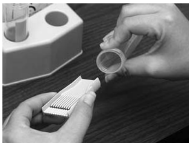
Figure 1. Insert Bubbler Comb into centrifuge tube (P/N 537-742/25).