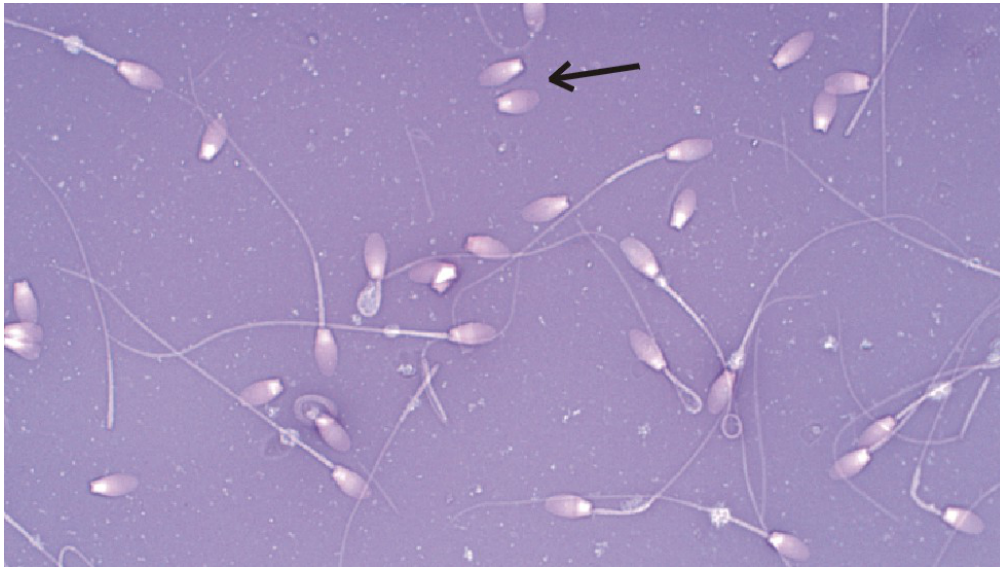
Figure 1. Photograph of spermatozoa in the first ejaculate from the clinical case. Note the abundance of detached heads (black arrow).

The stallion was collected multiple times over the subsequent three days. Semen parameters from those collections are presented in Table 2. Sperm concentration eventually stabilized at around 160 to 200 million sperm per ml and the total motility also stabilized at approximately 60 % by the 8 th collection. The stabilization of the semen parameters indicate that most of the dead spermatozoa had been removed or 'cleaned out' by the 8 th collection and we had reached 'daily sperm output'.